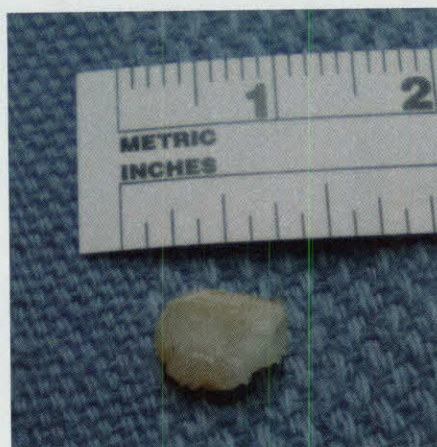
Here one can see the loose body "joint mouse" on the back table following removal from the ankle joint.

distinct pattern of injuries, including paresthesias of the superficial peroneal nerve and its branches. 2