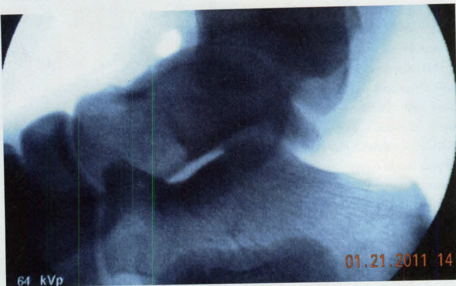
These intraoperative ankle stress radiographs demonstrate a pathological ankle with a positive talar tilt and anterior drawer sign.

Portal placement is the most critical detail of arthroscopy. Traditionally, surgeons utilize anteromedial and anterolateral portals. Create the anteromedial portal just medial to the tibialis anterior tendon and slightly distal to the joint line. We suggest employing an 18-gauge, 1.5-inch needle to locate the joint and using this as a reference point. Multiple authors recommend making this portal first. 5,6