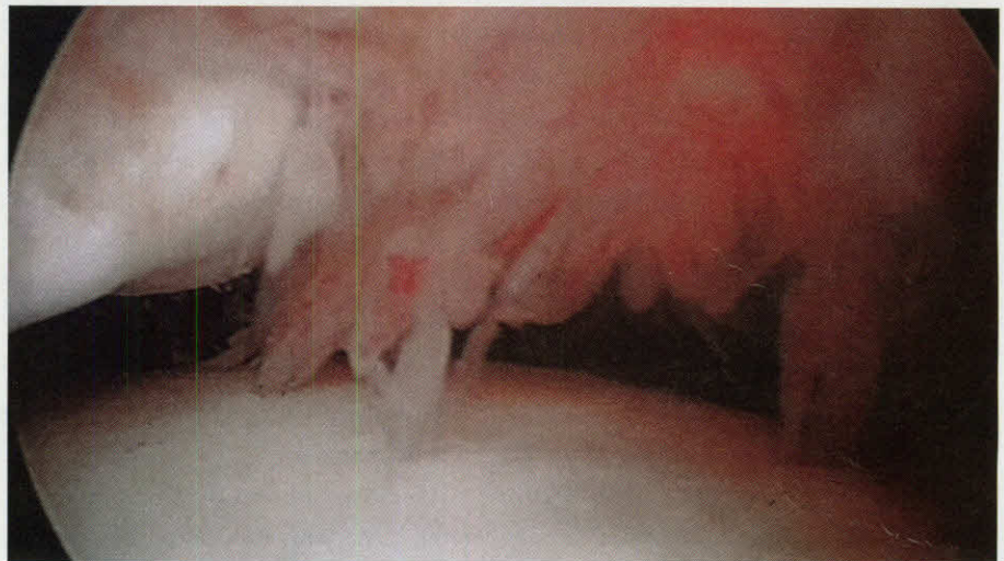
Here one can see an intraoperative arthroscopic view of an ankle with a combination acute hemorrhagic and chronic synovitis.

vital neurological structures, the surgeon must have a keen sense of the anatomy and pathology he or she is treating.