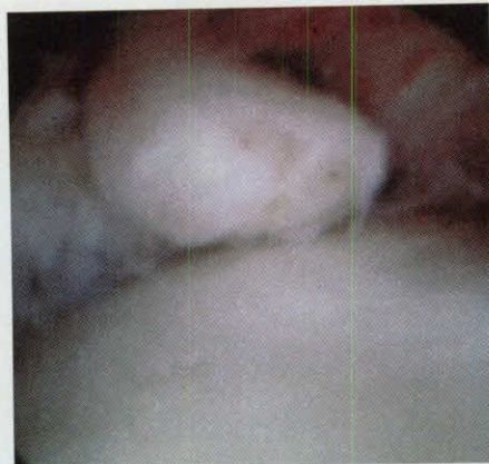
Here one can see an intraoperative view of a loose body "joint mouse."

Most commonly, patients develop a transient neuropraxia, a nerve injury that is largely due to stretch on the nerve itself. Transient neuropraxia may occur with more than one hour of distraction and 30 pounds of force. Electromyograms (EMGs) have shown changes in conduction velocity that are reversible. 7 Distractors are also associated with another